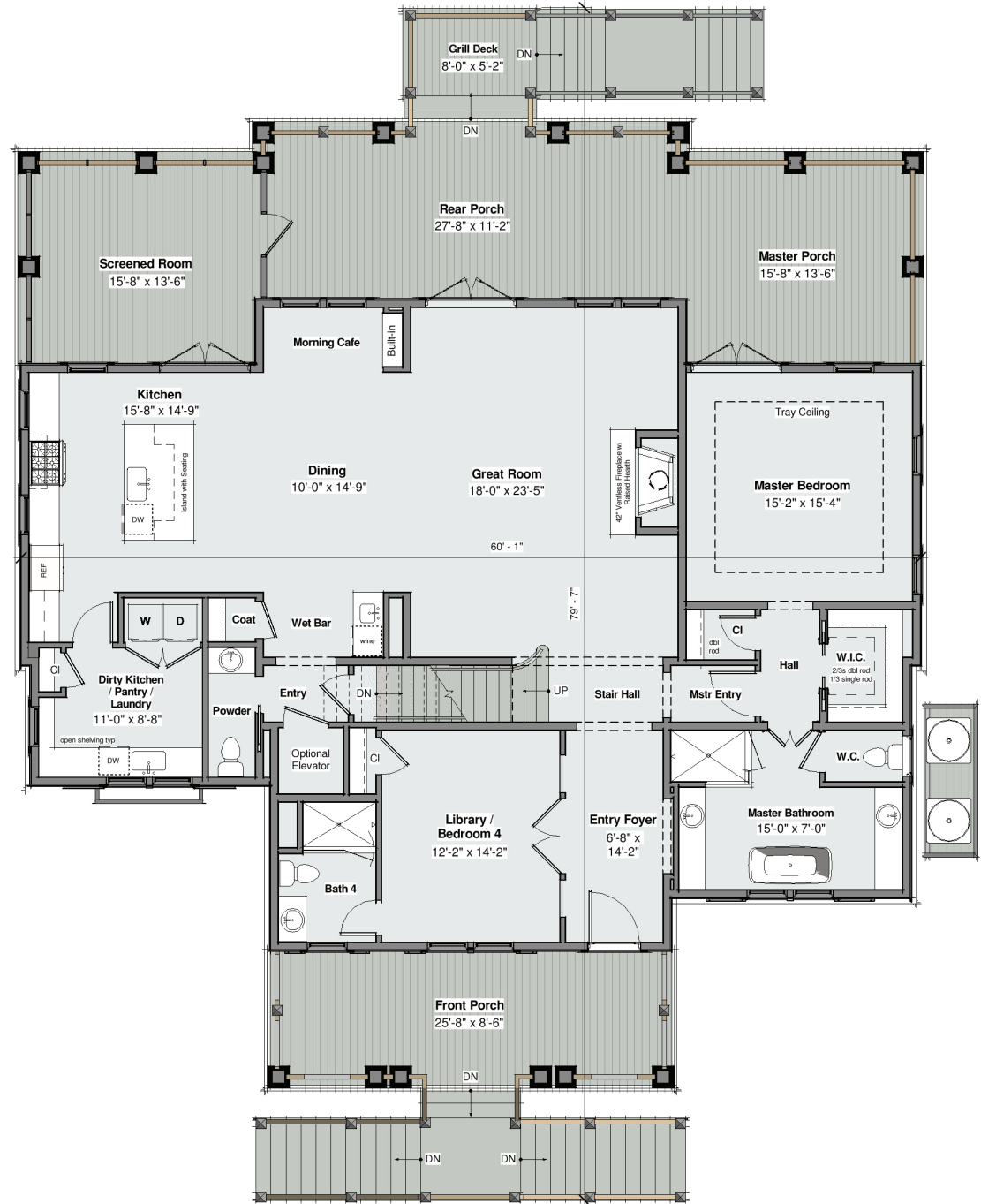
Main Level Floor Plan